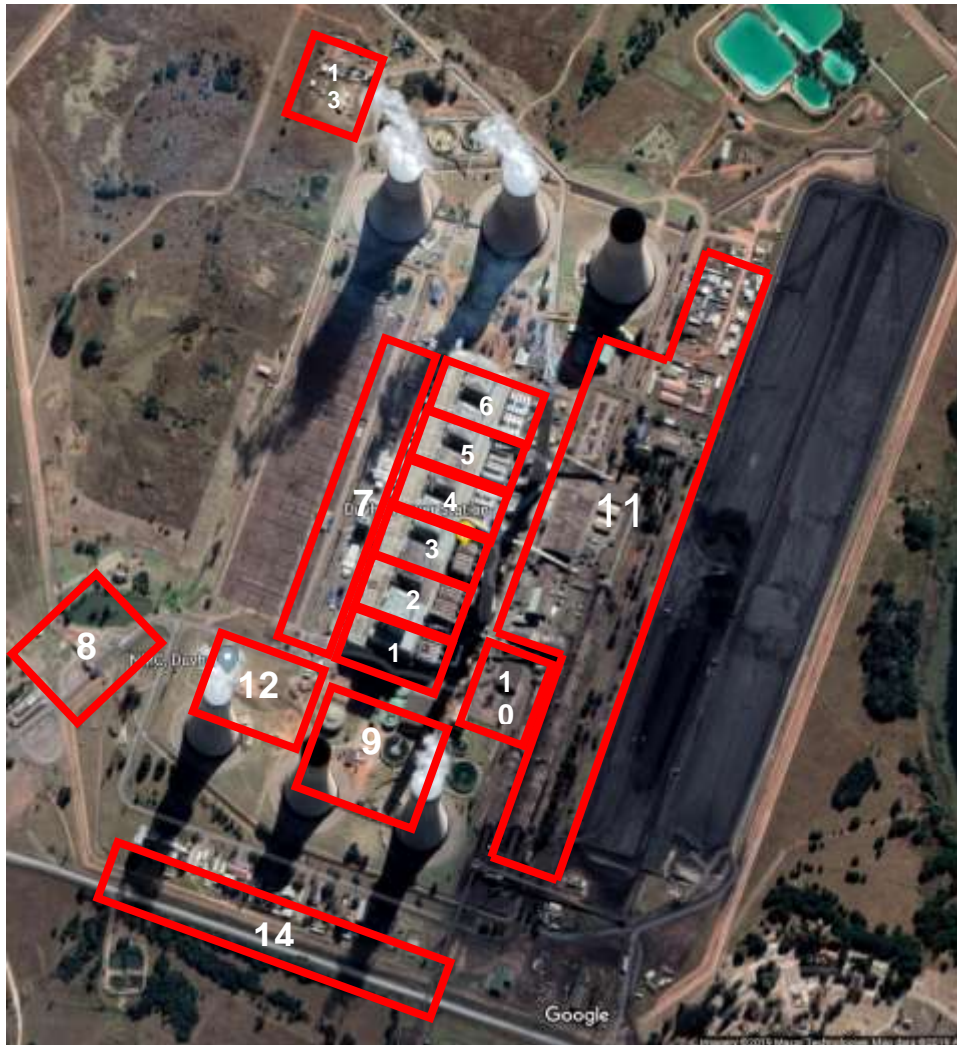
Figure 1: Station Zone Layout